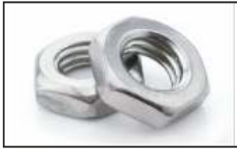
HEXAGON THIN NUT Din 439, 936 Size: M6 to M100