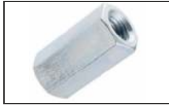
LONG NUT Size: M5 to M24