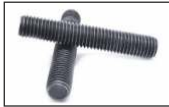
THREADED ROD DIN 975 Size: M3 to M64, 3/16" to 2"