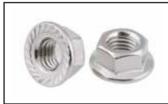
FLANGE NUT DIN 6923 Size: M3 to M16