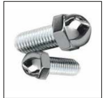
DOME HEAD BOLTS Size: M4 to M24