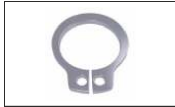
EXTERNAL CIRCLIP DIN 471 Size: M4 to M100