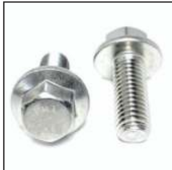
FLANGE BOLT DIN 6921 Size: M4 to M20