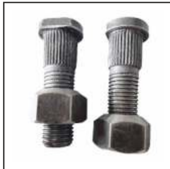
HUB BOLT Size M8 to M20