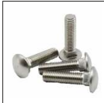
CARRIAGE BOLT DIN 603 Size: M5 to M20