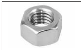
HEAVY HEX NUT Size: M6 to M72