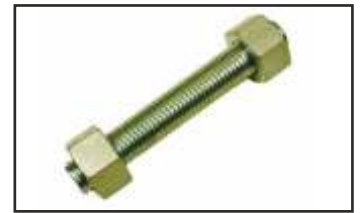
B7 STUD Size: M6 to M72