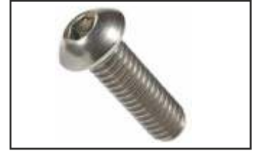
SOCKET BUTTON HEAD SCREW Size: M3 to M20