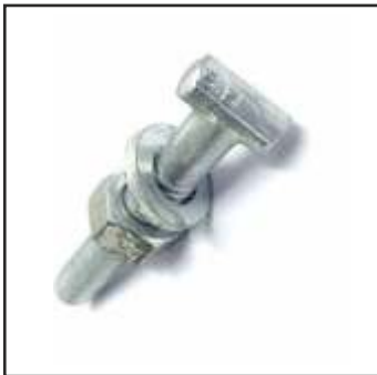
T BOLT Size (IS): COSTOMIZE