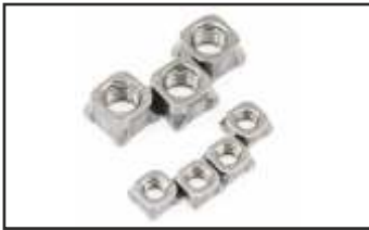
SQUARE WELD NUT DIN 928 Size M4 to M16