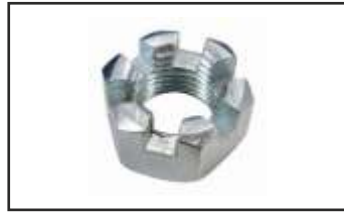
SLOTTED NUT Size: M5 to M39