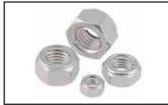
LOCK NUT DIN 439/ISO 7042 Size: M6 to M36, 1/4" to 2"