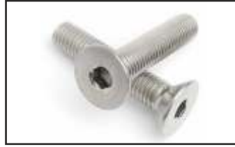
ALLEN CSK DIN 7991 ISO 10642 Size M3 to M24 3/16" to 5/8"