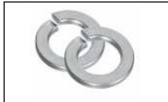
SPRING WASHER DIN 127 IS 3063 Size: M1.6 to M60