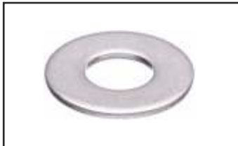
PLAIN WASHER DIN 125 Size: M1.6 to M60