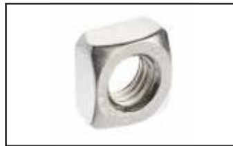
SQUARE NUT DIN 557 Size: M3 to M16