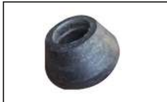
CONICAL WASHER Size: M20 to M24