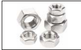
HEX NUT DIN 934/ANSI B18.2.4.1M Size: M16 to M100, 1/8" to 2"