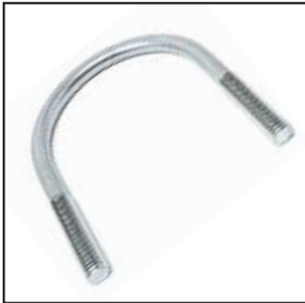
U BOLT DIN 3570 Size (IS): M6 to M39, 1/4" to 1.1/2"