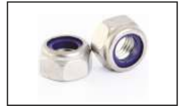
NYLOCK NUT DIN 982 Size: M2 to M45, 3/16" to 1.1/2"