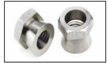
ANTI THEFT NUT Size: M6 to M39