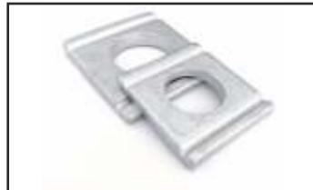
TAPER WASHER DIN 434 Size: M6 to M30