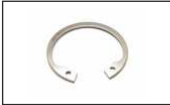
INTERNAL CIRCLIP DIN 472 Size: M4 to M100