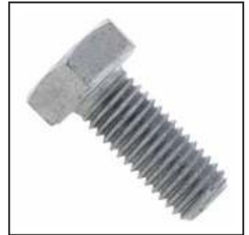
STRUCTURAL BOLT Size: M8 to M72