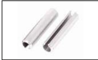
DOWEL PIN DIN 6325 Size: Dia 2 to 6