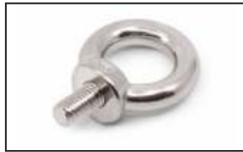
EYE BOLT DIN 580 Size M6 to M39