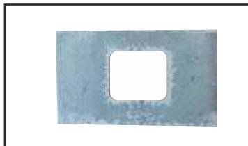
SPLICE WASHER Size : 75 x 45 x 4 mm