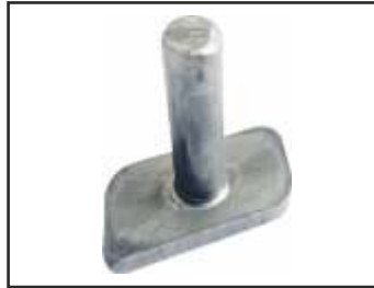
S Head Bolts