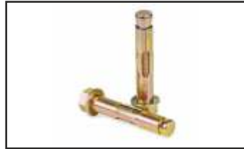
SLEEVE ANCHOR FASTENER Size: M6 to M24