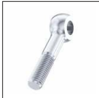
SMALL EYE BOLT DIN 444 Size: M6 to M24