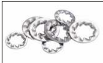
TOOTH WASHER DIN 6798 Size: M3 to M24