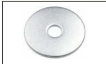
BIG OD WASHER DIN 9021 Size: M2 to M48