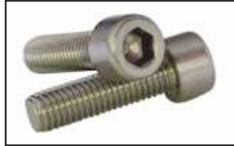
SOCKET HEAD CAP SCREW/ ALLEN CAP DIN 912 Sue M2 to M34 3/16" to 1