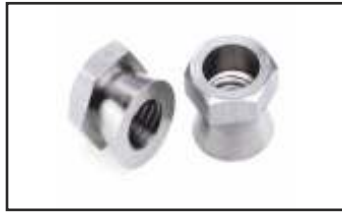
ANTI THEFT NUT Size: M6 to M 39