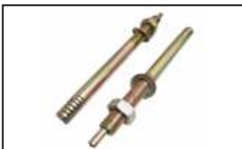
PIN TYPE ANCHOR BOLT Size: M6 to M24