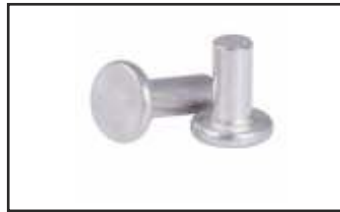
FLAT RIVET Size: M2 to M12