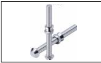
ANTI THEFT BOLT & NUT Size: M5 to M12