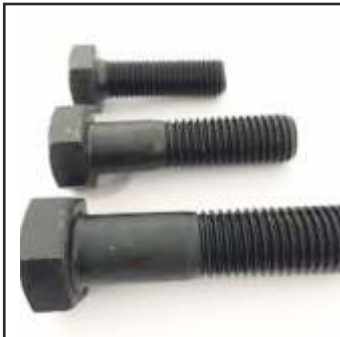
HEX BOLT DIN 931/ 151363 Size: M4 to M48, 1/8" to 2"