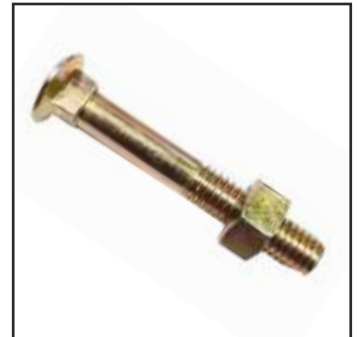
FALA BOLT Size: 3/8" x 1" to 3/8" x 4"