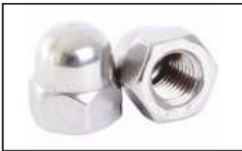
DOME NUT DIN 1587 Size: M3 to M24, 1/4" to 1