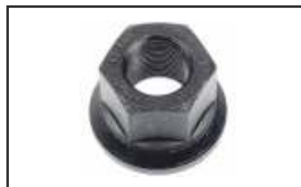
WHEEL NUT Size: M6 to M24