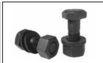
HSFG / Structure Bolts