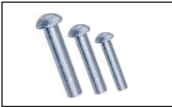
ROUND RIVET Size M2 to M12