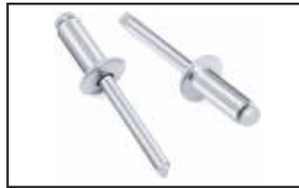
POP RIVETS Size: M3 to M6