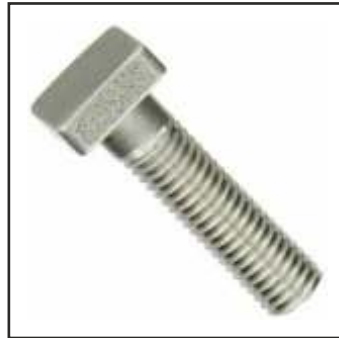
SQUARE HEAD BOLT Size M8 to M24