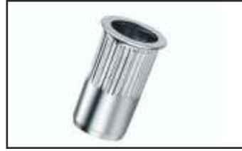
REDUCED HEAD KNURLED BODY Open End-Imperial Hole Size* Size (IS): M2 to M24, 5/16" to 5/8