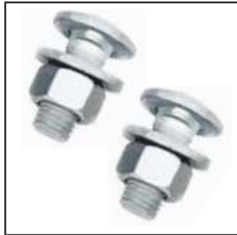
ROAD CRASH BARRIER BOLT Size M16 x 35mm / M16 x 40mm