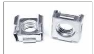
CAGE NUT Size M3 TO M12