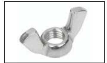
WING NUT DIN 315 Size (IS): M4 to M24, 1/4" to 1"