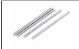
THREADED ROD BAR Size: M3 to M64